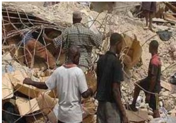
Plate 2.1: A collapsed building due to use of sub-standard material.

The sources of accidents on construction sites can be attributed to four (4) major factors. These are the design, construction, physical/environmental factors and mechanical factors (Ayininuola and Olalusi 2004). Ayininuola and Olalusi (2004) asserted that a large number of accidents have occurred in building sites due to failure of temporary or partially complete structures and poor specification. Ayininuola and Olalusi (2004) described failure as an unacceptable difference between expected and observed performance. A failure can be considered as occurring in a component when that component can no longer be relied upon to fulfill its principal function and therefore this can cause a health hazard. Ayininuola and Olalusi (2004) observed that many accidents in Nigeria have occurred in building sites due to lack of sufficient technical expertise by the builder. For instance, use of sub-standard material has led to building collapse as shown in Plate 2.1.