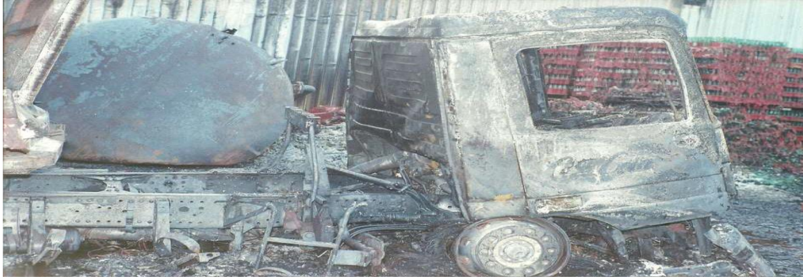
Plate 2.2: A typical Work Place Accident preventable through regular Factory and Labour Inspections